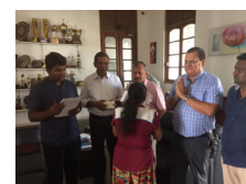
Members of the support staff being Given Gift Vouchers for Christmas 2018