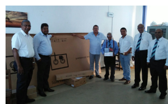
President of the OBU and Exco Committee Members handing over the three Smart Boards for the Highfield block

Old Boys Union of Wesley College Website | http://www.wesleyobu.lk