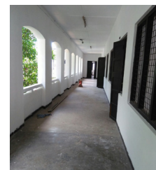
The corridors in the highfield block after renovation