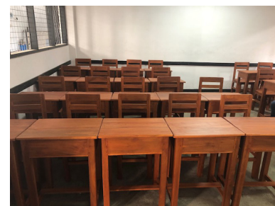
New Desks and Chairs